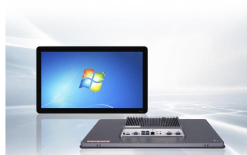
Above image is for representation purpose only. Real unit might look different