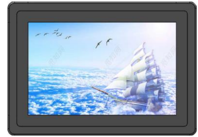
Above image is for representation purpose only. Real unit might look different